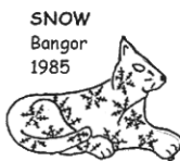
SNOW Bangor 1985