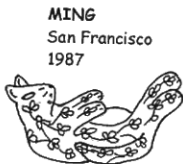
MING San Francisco 1987